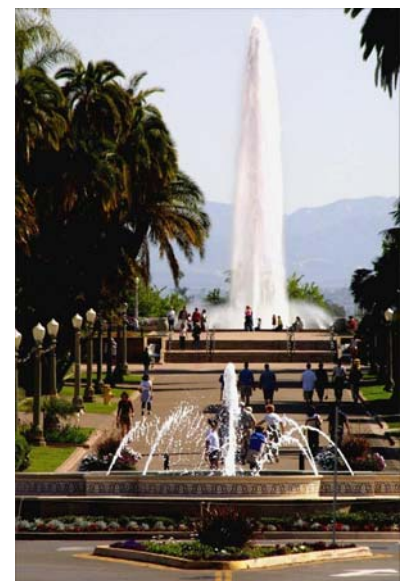
Fountains in Balboa Park

Don't forget to register soon for the San Diego meeting! March 2010 will be here before we know it!