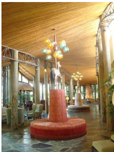
The Lobby at Paradise Point

Members interested in library instruction and services will also have plenty to interest them. The Instruction Subcommittee is sponsoring two sessions, one on applying general curriculum literacy objectives to the music classroom/studio and one presenting a mini-course designed to update graduate students' research skills. The Education Outreach Program will sponsor a session on a distance learning music librarianship course. And in “Non-Music E-Resources: Goldmines for Music Research,” sponsored by the Reference Sources Subcommittee, there will be two presentations related to using general e-resources to find music materials: searching American historical newspaper databases for music information, and finding music dissertations in ProQuest Dissertations and other similar databases, as well as a presentation on how librarians' informal relationships with potential clients (like advising a student group, performing in a community organization, etc.) can lead to professional interactions. The Reference Sources Subcommittee will also bring us a panel discussion of “Music Library Webpages as Portals of Information.” There will also be member-proposed presentations on library sources for continued on next page